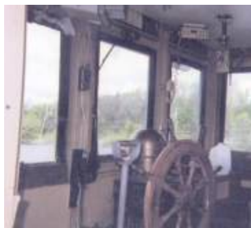
1954 45' x 12.5' x 6' Steel Ex Army Tug - ST Model • Powered by 400 hp Buda Diesel engine