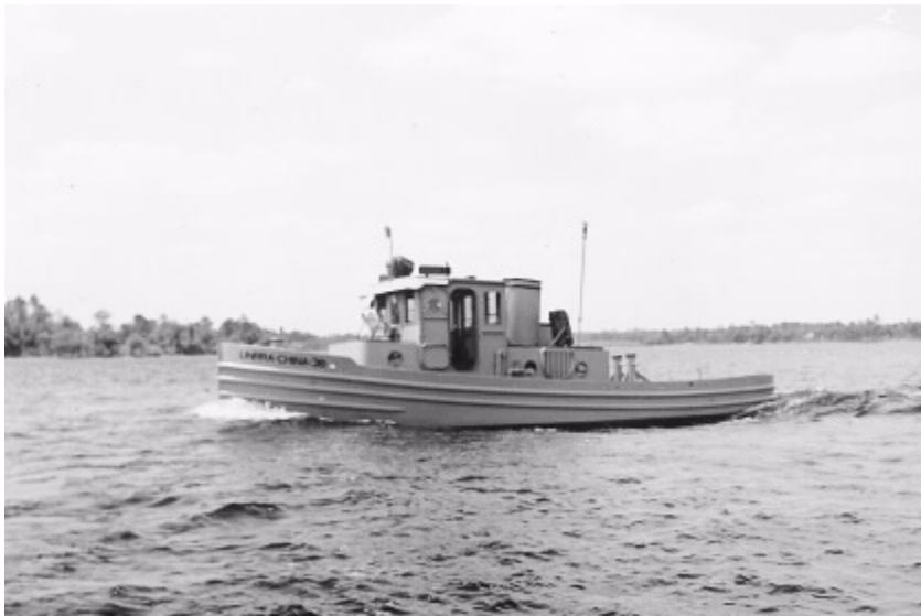
Here's a photo courtesy Harley Strickland showing an Olson-made Design 320 45' tug: UNRRA-China-35 from 1946

At least seven of these were made at the Olson Corporation on the shores of Lake Beresford beginning in 1946. At least one went to China (probably Taiwan) via the United Nations Relief & Recovery Agency. Actually begun in 1943 and not related to the “UN” commonly known, the UNRRA changed its name in 1947. It also is possible that a wartime batch were made in 1943 as a series of seven hull numbers at the earlier American Manufactory Corporation at Lake Beresford are not yet identified as to which type of boats were produced, but they probably were not sold to the US Army. Research continues!