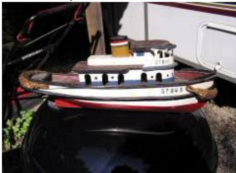
Made by unknown person