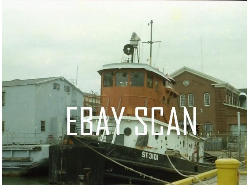
Photo on Ebay 11 22 13; looks like a 65' Korean era boat: the tugboat number list including some ST's continues into the 1300's? The 3,000's? Apparently so, but no details exist other than these two photos as proof. I've also seen a blog for an "ST" bell found with a number in the 1100's...???????